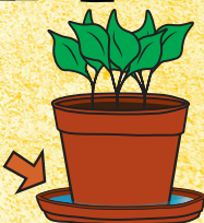
Potted plant saucers