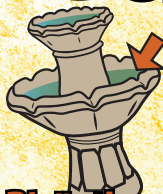
Birdbaths and Fountains