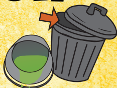
Containers & buckets

Aedes mosquito larvae can survive in very small amounts of water - even 1/4" is too much: Dump it out!